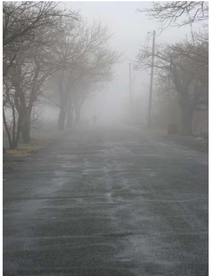
A foggy fall day on the pier.

The bridge people also gave the Piermont Rowing Club a $35,000 grant to buy materials to improve its ramp. The vil-