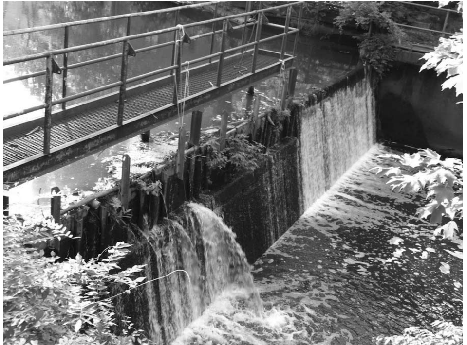
Dam on Sparkill Creek at Rockland Road Bridge.