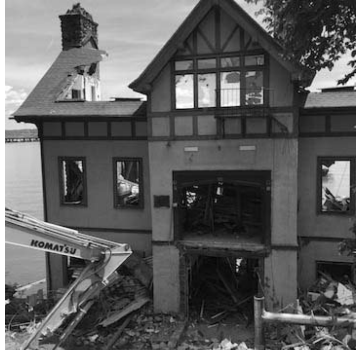
The old Grand View village hall is demolished, another victim of Superstorm Sandy.