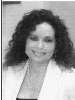
Owned And Operated By NRT LLC.